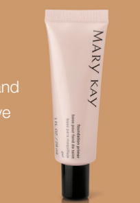
Mary Kay® Foundation Primer, $16

The Mary Kay® Foundation Primer along with TimeWise® Age-Fighting Lip Primer and Mary Kay® Eye Primer offer comprehensive priming benefits for the entire face. That means foundations, powders and color products apply smoothly and perform better for a fresh face.